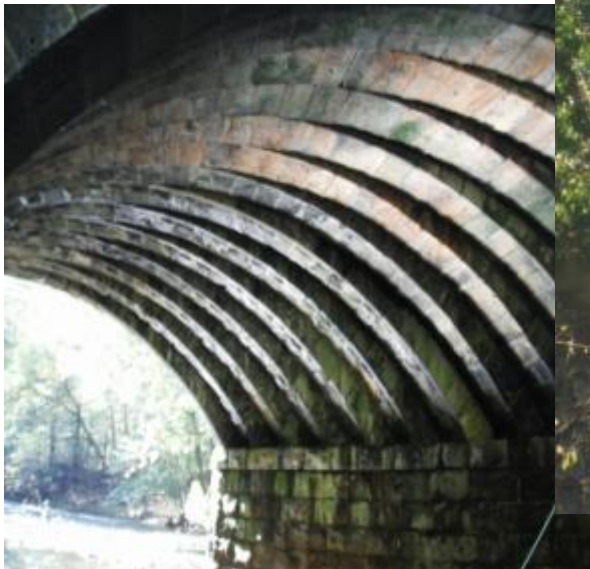
Under a “j” trestle