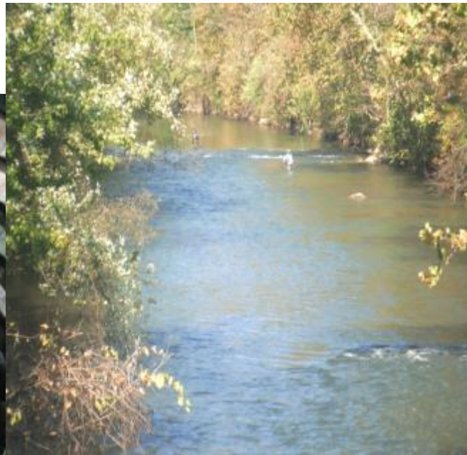
Greenhill’s Camp pool