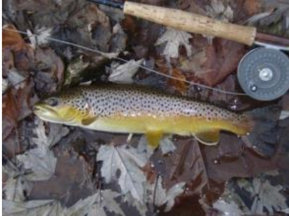
Fall Brown from the Church pool